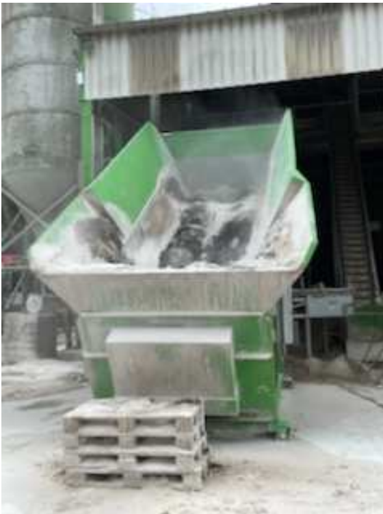
S. Klose / EuPhoRe GmbH